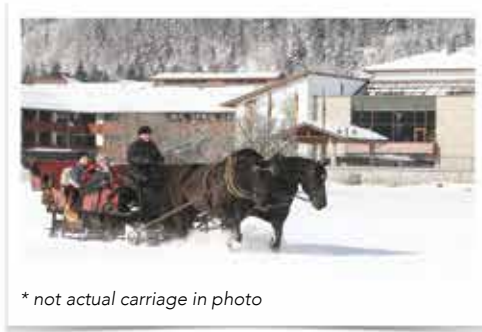
* not actual carriage in photo

Enjoy the simple pleasure of a horse-drawn carriage ride through beautiful Garmisch. One of our most popular activities that the whole family can enjoy and a great way to get acquainted with the town of Garmisch. Children 1-14 must pay child's price. Three time slots are available on days that the tour runs.